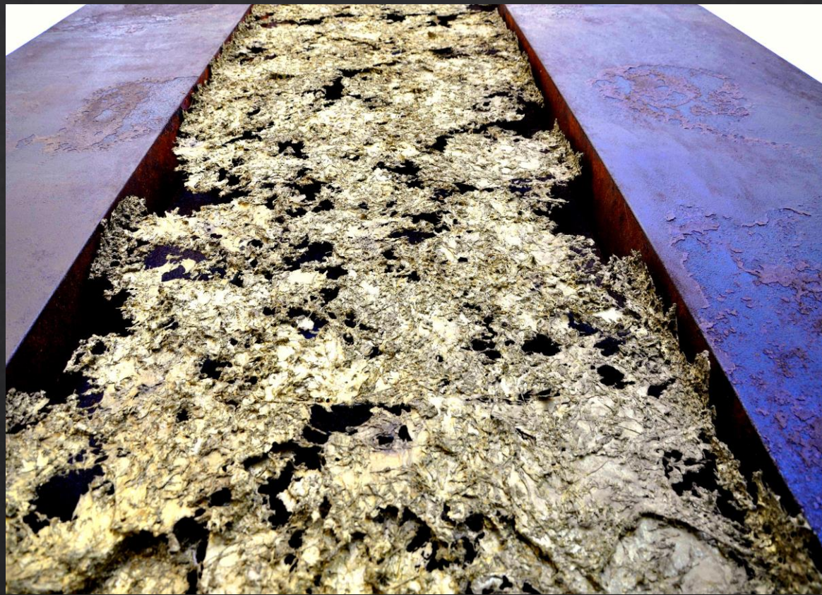
Sculptural element combined with corten steel at the Scientific- Technical Building at University of Almería